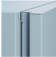
C - Side Access Pull