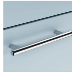
Q - Bar Pull