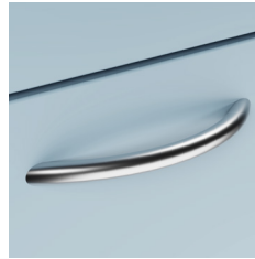
S - Satin Nickel Loop