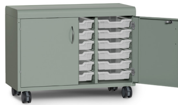
MGS9KL3 3 Columns, 2 Doors 18 Polycarbonate Totes 32"H x 19"D x 42"W List $4,275