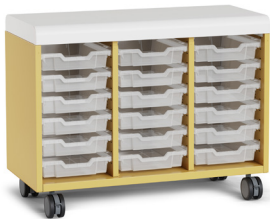
RMC9KL3 3 Columns, Open 18 Polycarbonate Totes 32"H x 19"D x 42"W List $3,394