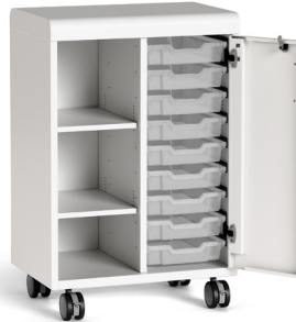
MGS1L2S 2 Columns, 1 Door 9 Polycarbonate Totes 2 Adjustable Shelves - Left 43"H x 19"D x 28"W List $3,535