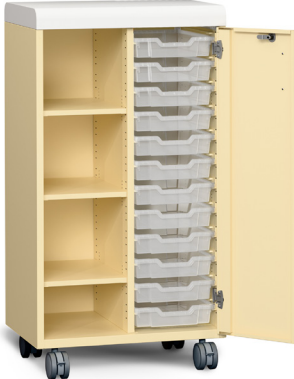
MGS2L2S 2 Columns, 1 Door 12 Polycarbonate Totes 3 Adjustable Shelves - Left 53.5"H x 19"D x 28"W List $3,755