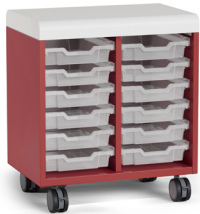
RMC9KL2 2 Columns, Open 12 Polycarbonate Totes 32"H x 19"D x 28"W List $2,440