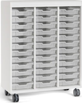
RMC2LL3 3 Columns, Open 36 Polycarbonate Totes 53.5"H x 19"D x 42"W List $4,638