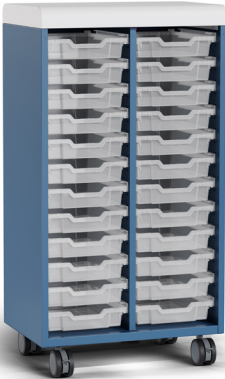
RMC2LL2 2 Columns, Open 24 Polycarbonate Totes 53.5"H x 19"D x 28"W List $3,745