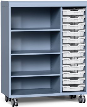
RMC2L3S 3 Columns, Open 12 Polycarbonate Totes 3 Adjustable Shelves - Left 53.5"H x 19"D x 42"W List $3,200