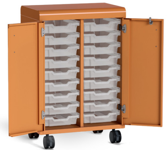
MGS1LL2 2 Columns, 2 Doors 18 Polycarbonate Totes 43"H x 19"D x 28"W List $4,165