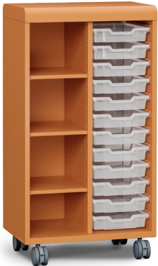
RMC2L2S 2 Columns, Open 12 Polycarbonate Totes 3 Adjustable Shelves - Left 53.5"H x 19"D x 28"W List $3,020