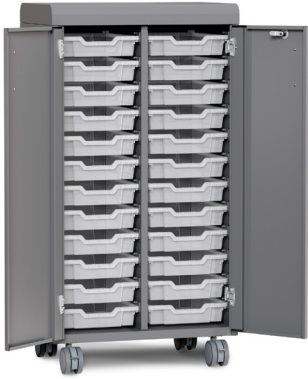
MGS2LL2 2 Columns, 2 Doors 24 Polycarbonate Totes 53.5"H x 19"D x 28"W List $4,555