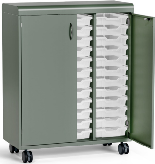
MGS2LL3 3 Columns, 2 Doors 36 Polycarbonate Totes 53.5"H x 19"D x 42"W List $5,985