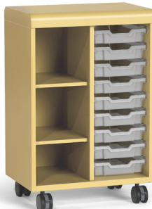
RMC1L2S 2 Columns, Open 9 Polycarbonate Totes 2 Adjustable Shelves - Left 43"H x 19"D x 28"W List $2,940