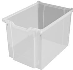
FS2520 Polycarbonate Totes 12"H x 16.6"D x 13.3"W List $95