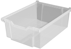
FS0220 Polycarbonate Totes 6"H x 16.6"D x 13.3"W List $55