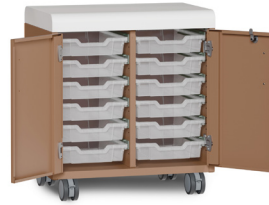
MGS9KL2 2 Columns, 2 Doors 12 Polycarbonate Totes 32"H x 19"D x 28"W List $3,419