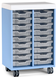
RMC1LL2 2 Columns, Open 18 Polycarbonate Totes 43"H x 19"D x 28"W List $3,297