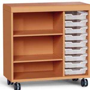
RMC1L3S 3 Columns, Open 9 Polycarbonate Totes 2 Adjustable Shelves - Left 43"H x 19"D x 42"W List $2,865