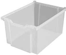
FS0320 Polycarbonate Totes 9"H x 16.6"D x 13.3"W List $85