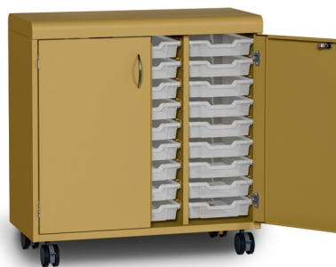
MGS1LL3 3 Columns, 2 Doors 27 Polycarbonate Totes 43"H x 19"D x 42"W List $5,290