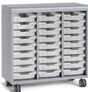
RMC1LL3 3 Columns, Open 27 Polycarbonate Totes 43"H x 19"D x 42"W List $3,981