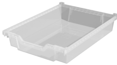
FS0120 Polycarbonate Totes 3"H x 16.6"D x 13.3"W List $42