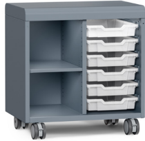
RMC9K2S 2 Columns, Open 6 Polycarbonate Totes 1 Adjustable Shelf - Left 32"H x 19"D x 28"W List $2,505