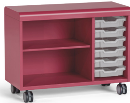
RMC9K3S 3 Columns, Open 6 Polycarbonate Totes 1 Adjustable Shelf 32"H x 19"D x 42"W List $2,605