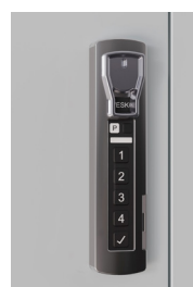
Nano E-Lock Mini Keypad (WE)