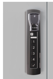
Nano E-Lock Mini Keypad (WE)