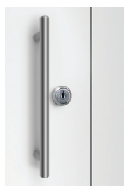
Q – Bar Pull