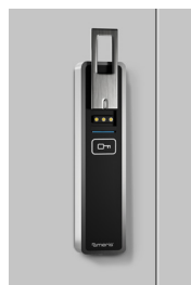
E-Lock Mini RFID