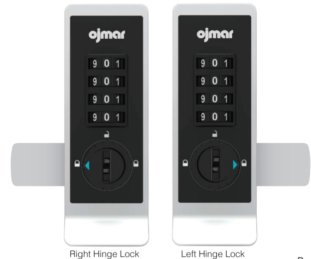
Right Hinge Lock