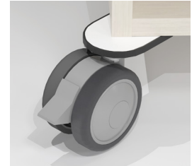
Optional Outrigger Caster Add $291