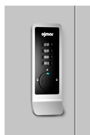
Mechanical Square Front