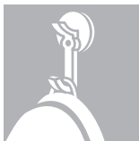
2-Prong Coat Hooks