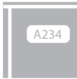
Locker Door Number Plates