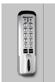
E-Lock Square Front or A-Full Pull