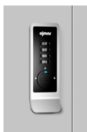
Mechanical Square Front