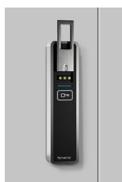
E-Lock Mini RFID Square Front