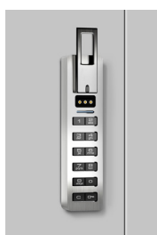
E-Lock Mini Keypad Square Front