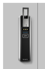
E-Lock Mini RFID Square Front