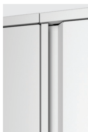
A - Full Pull