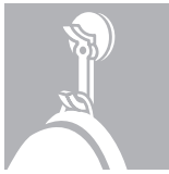
2-Prong Coat Hooks