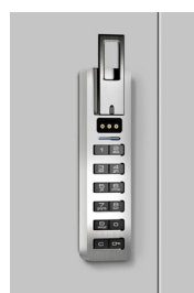
E-Lock Mini Keypad Square Front