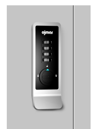
Mechanical Square Front