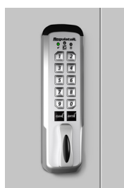
E-Lock Square Front or A-Full Pull