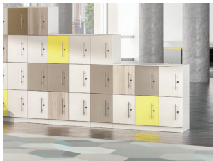
Multi Color Door Fronts: Visit our website for details