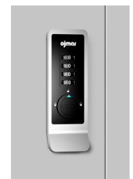
Mechanical Square Front