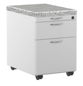
Box/File 37 mm black casters