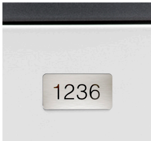
Door Number Plates