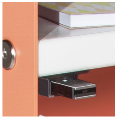
Magnetic Touch Latch