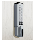
E. Integrated Lock Pull (Metal and Laminate Fronts)