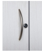
S. Satin Nickel Pull