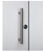
Q. Bar Pull