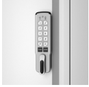
A: Full Pull with E-Lock (Metal Fronts Only)