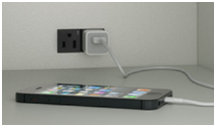
Interior Power Outlet