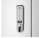
E: Integrated Lock Pull (Metal and Laminate Fronts)